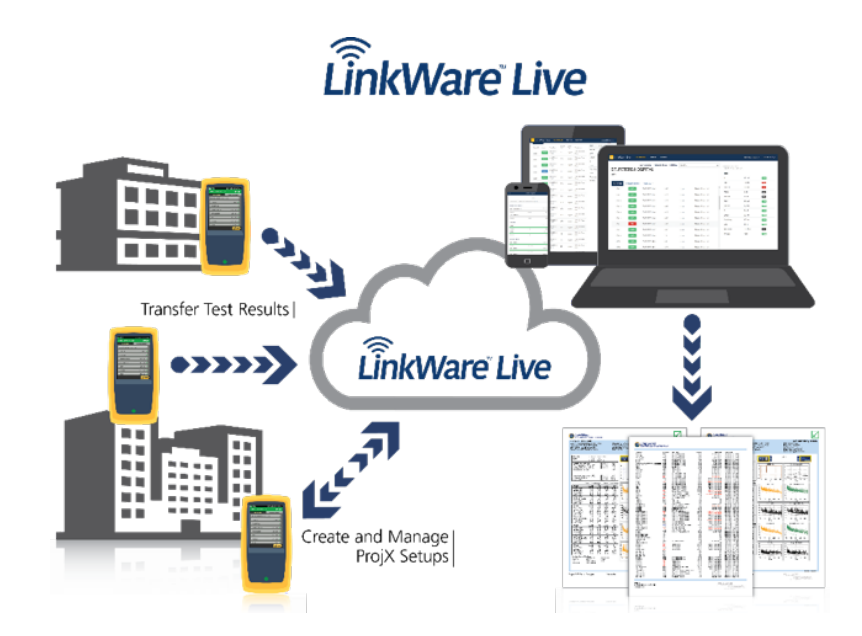
Figura 4. With LinkWare Live, Project Managers can create and manage test settings and transfer them to testers. Techs can upload test results, allowing the Project Managers to track job progress.

Fluke Networks LinkWare Live takes this concept to the next level by efficiently loading the entire project test plan complete with LL or ULL limits into the tester. This web-based service also features a built-in version of the SYSTIMAX loss calculator. Project Managers can set up the requirements for the project, including the SYSTIMAX limits, from their office on a PC or tablet. Technicians in the field can download the settings over Wi-Fi to one or more CertiFiber Pro units in the field, which is especially efficient for large projects as such as data centers. During testing, the CertiFiber Pro uses its length measurement result to calculate a precise limit for the link. Test results are uploaded over Wi-Fi to LinkWare Live, allowing the project manager to track overall progress or look at individual results.