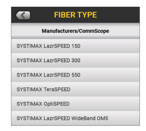
Figura 5. CertiFiber Pro supports all SYSTIMAX High Speed Migration fiber types

In a word, no. Telecommunications Industry Association experts found that if a proper launch condition is used, such as encircled flux, the difference in connection attenuation between different wavelengths will be "bound". This means that a link passing at 850 and 1300 nm will also have acceptable loss at wavelengths in between. Other standards bodies have demonstrated that this assertion is true. Therefore, testing OM5 at the two wavelength extremes of 850 nm and 1300 nm, as provided by the CertiFiber Pro, provides adequate and prudent testing.