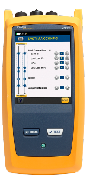
Figura 3. The CommScope SYSTIMAX Link Loss Calculator is built-in to the latest version of Fluke Networks CertiFiber Pro Optical Loss Test Set. CertiFiber Pros owners can add the calculator to their testers with a free download from the Fluke Networks website

Fluke Networks CertiFiber<sup>®</sup> Pro Optical Loss Test set can measure the length of the fiber when testing, offering a solution to the problem. With the CertiFiber Pro, the operator sets up a test by selecting a fiber type and then entering the numbers and types of connectors and splices into the tester (Figure 3). Then, each time a test is made, the tester automatically measures the length and feeds that to the built-in SYSTIMAX calculator to generate the exact loss limit for that link. This eliminates the need for multiple limits based on length. With less data to enter, this process is even simpler than the PC-based calculator, and further eliminates the chance of errors when transferring the limits from the PC to the tester.