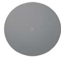
Impeccably cleaned by CleMate 400