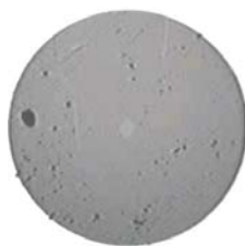
Stained by Dust and Particles